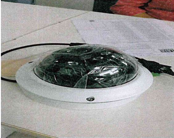
Model Name SATATYA CIDR50FL40CWP P2